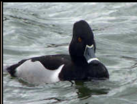
Please send your favorite birding photos to: editor@saaudubon.org