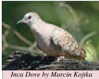
Inca Dove