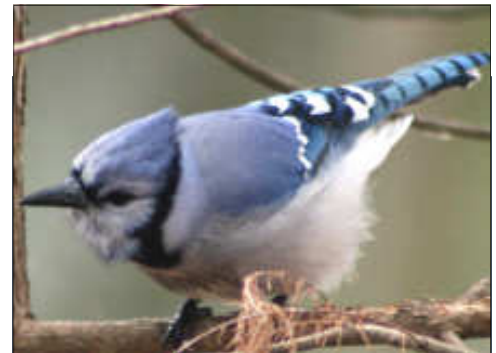
Blue Jay by Marcin Kojtka

In common with other New World jays, Blue Jays possess a special jaw adaptation that allows them to employ the heavy bill more efficiently as a chisel when opening hard-shelled nuts. Blue Jays also feed upon insects, and the