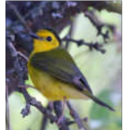
Hooded Warbler