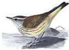
Louisiana Waterthrush by LA Fuertes