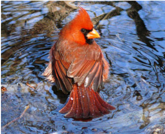
Northern Cardinal