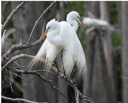
Great Egrets