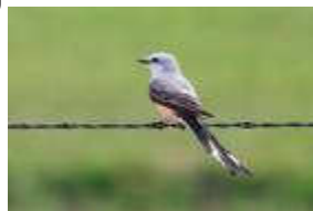
Scissor-tailed Flycatcher by Joan Lasswell

With Mike Creese leading the way for four birders accompanying him, a bountiful number of species was observed—60 in all. Most notable were the Great Blue, Little Blue and Tri-colored Herons; White-faced Ibis; Harris's Hawk; Wild Turkey; Northern Bobwhite; Common Moorhen; Black-necked Stilt; Lesser Yellowlegs; Spotted Sandpiper; Laughing Gull; Forster's Tern; Vermilion, Ash-throated, Scissor-tailed and Brown-crested Flycatchers; Bell's Vireo; Verdin; Long-billed Thrasher; Olive Sparrow; Lark Sparrow and Bullock's Oriole.