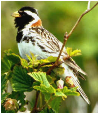
Male Lapland Longspur

The name “longspur” refers to the long, straight hind toenail, an adaptation common among ground-dwelling songbirds. Four longspur species occur in North America; all nest and feed upon the ground in open areas and all form large flocks in winter. Two species, the Chestnut-collared and McCown’s Longspur, nest in shortgrass prairie on the Northern Plains, while the Lapland and Smith’s Longspurs breed in the open tundra of the Far North.