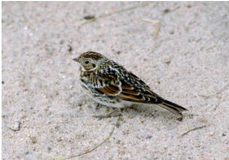
Female Lapland Longspur by Ansgar Walk

Probably arising in part from their abundance, several major mortality events affecting Lapland Longspurs on the winter range have been observed, most associated with winter storms. As many as 5 million were estimated to have perished in one blizzard event across the Northern Plains and an estimated 10,000 individuals were found dead along Interstate 35 in North Texas following a snowstorm. Thousands at a time have also been found dead after overnight collision or disorientation events associated with bright lights and tall structures during inclement weather.