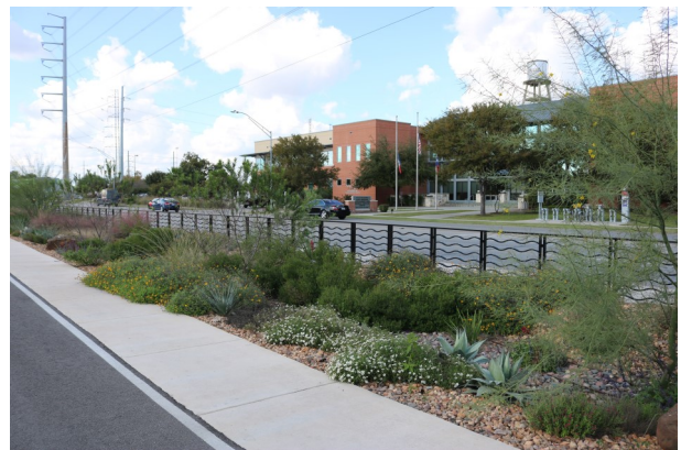
Low Impact Design (LID) bioswale in parking lot at 1902 S. Alamo.