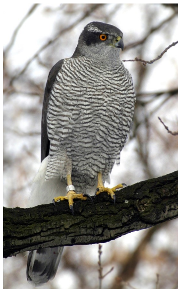
Northern Goshawk

some distance ahead. It was raven-sized and somewhat similar in proportion. The rapid Accipiter-like flight seemed too swift for a Red-tailed or Red-shouldered Hawk. This hawk resembled the same bird I had come across two weeks earlier just two miles away. It may have been a Northern Goshawk ( Accipiter gentilis ).